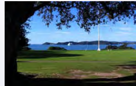
Waitangi Treaty Grounds